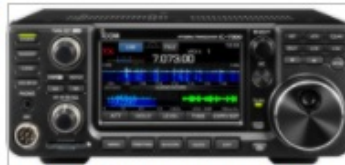
Voice & Data Transceiver with worldwide reach

We bring added fulfillment to many lives by helping local residents get ham radio licenses, gain skills and SERVE THEIR COMMUNITY with those skills & assets.